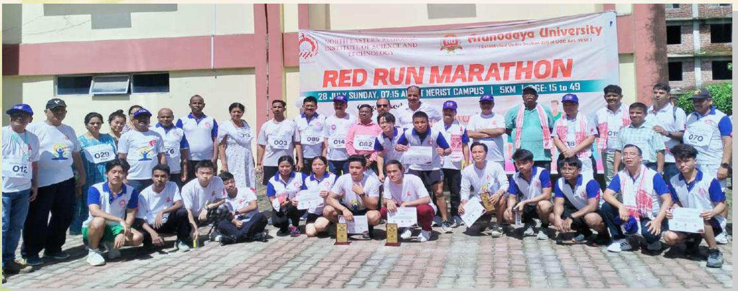
ARUNODAYA UNIVERSITY (Established Under Section 217 of UOC Act, 1956) RED RUN MARATHON 28 JULY SUNDAY, 07:15 AM | NERIST CAMPUS | 5KM | AGE: 15 to 49